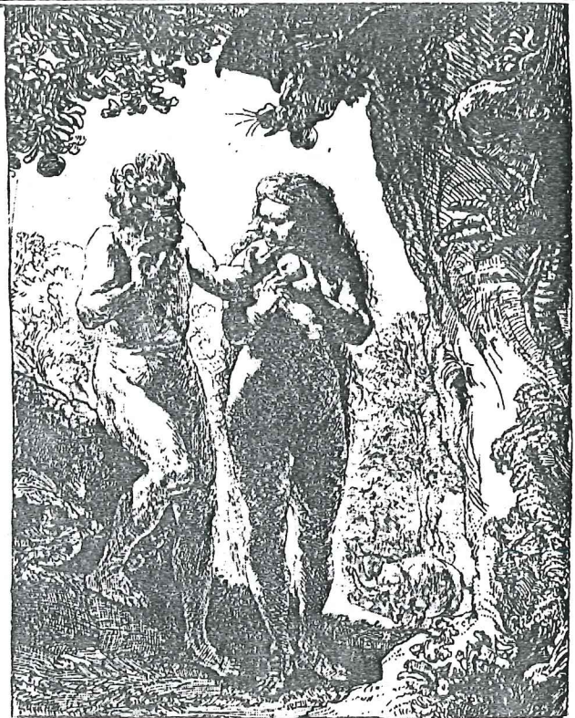
Rembrandt's Adam and Eve

His women are not conventionally beautiful; nor are