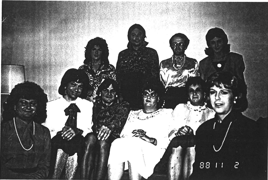
Girls just want to have fun. Some of the members on the occasion of our six month anniversary.

For the time being, we are pleased with the progress we've made in seven months and excited by our potential. We urge those of you who have not yet attended a meeting to consider stopping by one evening. The group is stronger for your participation and all our members have benefited from the support and friendship of our young organization.